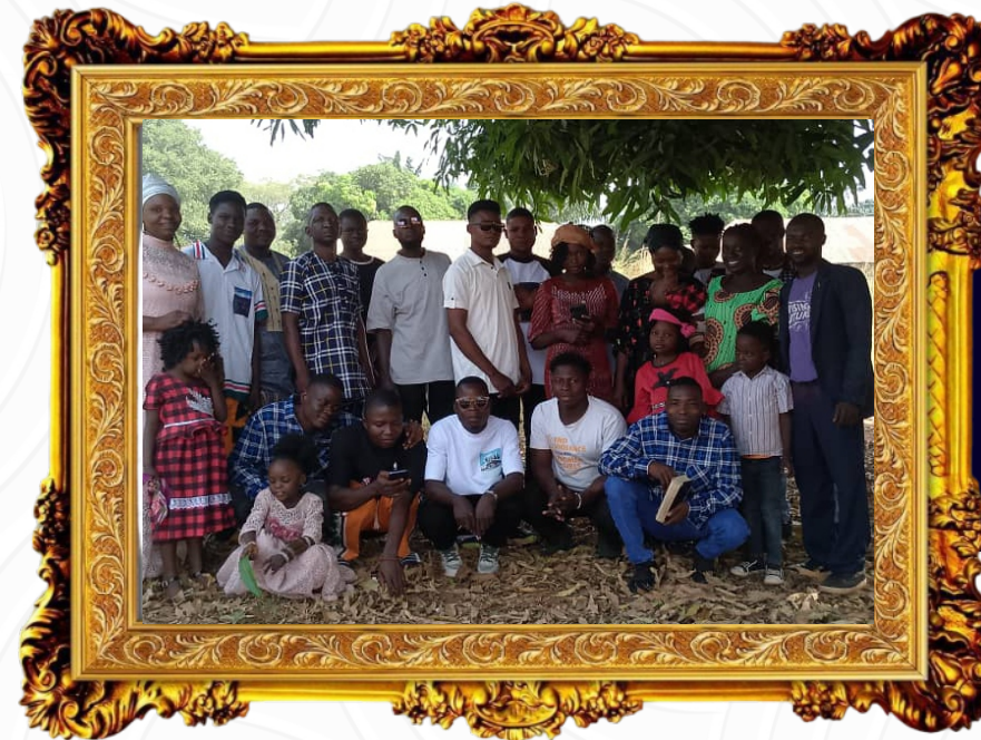
HAUSA CHURCH MEMBERS IN ANYIGBA

Having come this far, it became necessary to gather missionaries within our reach to encourage them in person. This birthed the Missionary Encouragement Program (MEP).