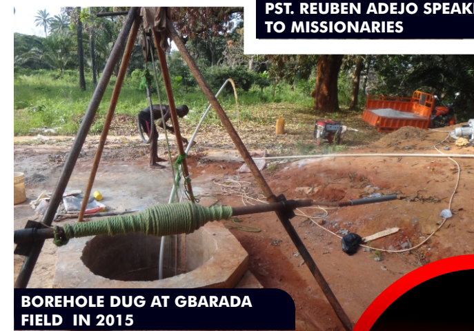
BOREHOLE DUG AT GBARADA FIELD IN 2015