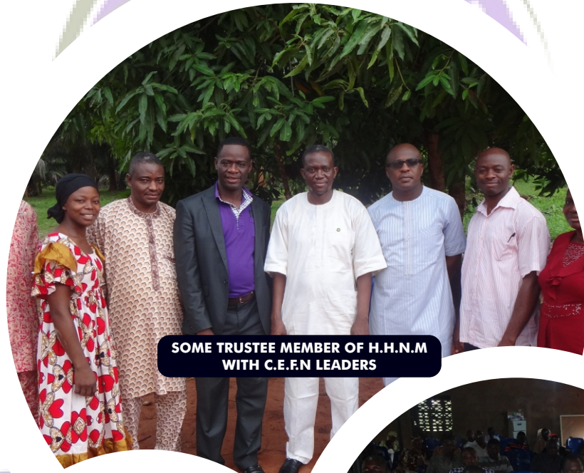
SOME TRUSTEE MEMBER OF H.H.N.M WITH C.E.FN LEADERS