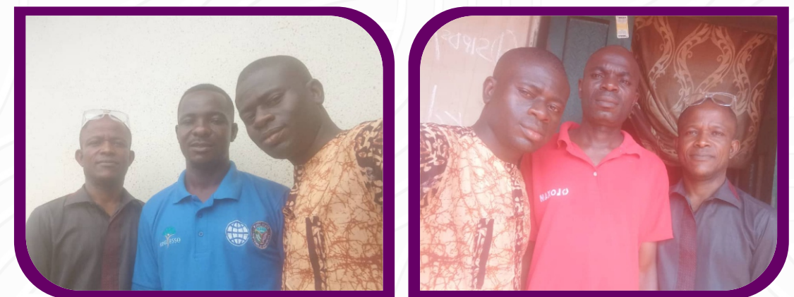
(HHNM) Sta fvisited missionaries on the field in Ajiolo and Odu-Ogbaloto both in Dekina Local Government in Kogi State Nigeria